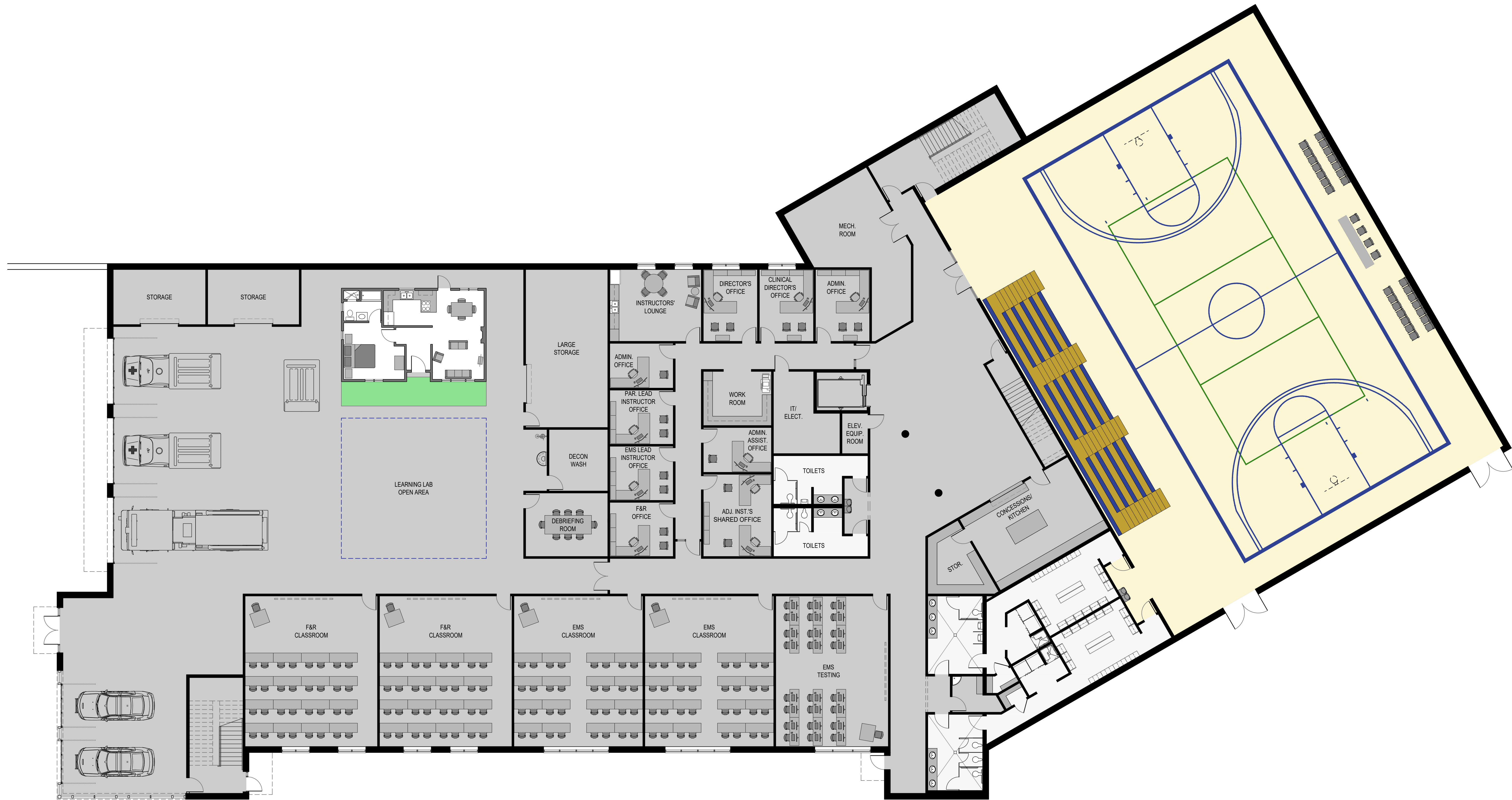
GROUND FLOOR PLAN 1" = 10'-0" 31,600 SQ. FT. FURNITURE IS FOR REFERENCE ONLY.

THESE DRAWINGS & THE DESIGN THEREON ARE THE PROPERTY OF HOLLAND & HAMRICK ARCHITECTS, P.A. & MAY NOT BE REPRODUCED OR REUSED WITHOUT WRITTEN CONSENT. HOLLAND & HAMRICK ARCHITECTS, P.A. No. 50030 SHELBY, N.C. SINCE 1933